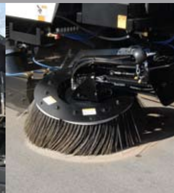
In Cab Hydraulic Tilt