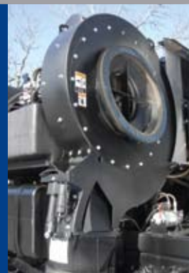
Whisper Wheel SM Fan System

The Schwarze A9 Monsoon is a chassis mounted, regenerative air street sweeper with a 9.6 cubic yard hopper. With over 20 years of successful operation throughout the world, the A9 Monsoon is a heavy duty workhorse that will provide a high quality option with a low cost of ownership. Come to the people you know for the products you trust.