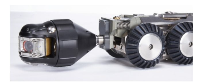
KS 60 HD camera From 4" inches