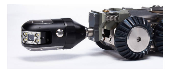
KS 40 camera From 3" inches