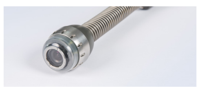
SAT 42 camera From 2" inches