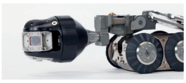
KS 60 DB camera From 4" inches