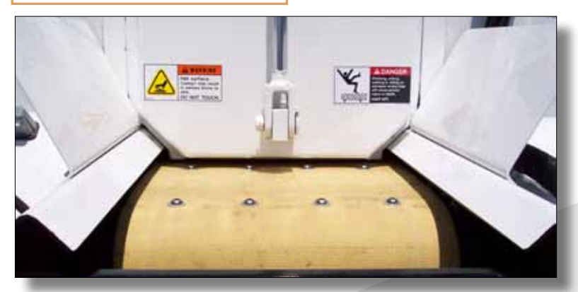
Heavy Duty Kevlar Conveyor Belt

An extremely durable, long-lasting Kevlar belt moves asphalt out of the container for continuous operation.