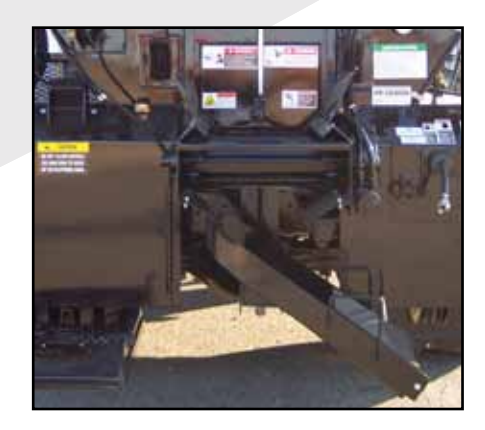
Pivoting Asphalt Chute