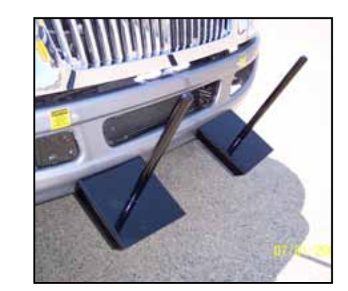
Safety Cone Holders