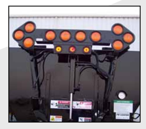
Arrow Board with Bracket