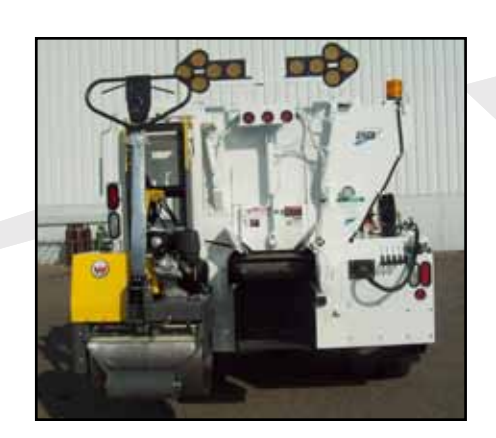
Roller Transport Device