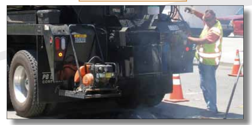
Adjustable Temperature Keeps Asphalt Hot

The Radiant Heat System on PB Patchers keeps asphalt hot for a full shift. Welded heat tubes spread the heat throughout the asphalt container. Temperature range is adjustable from 100° to 300°.