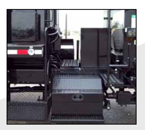
Catwalks for Accesibility