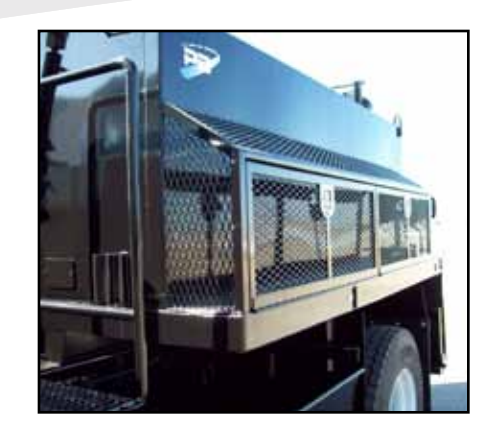
Lockable Tool Basket