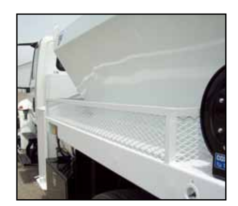
Open Tool Basket