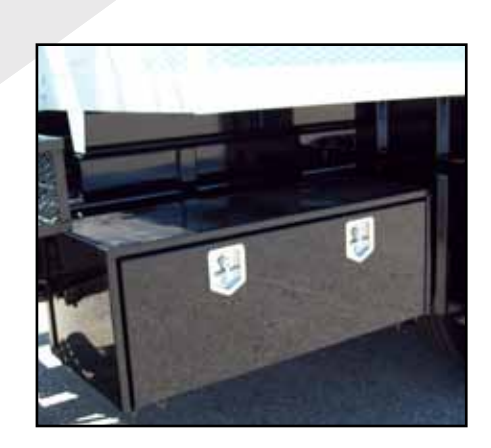
Underdeck Tool Box