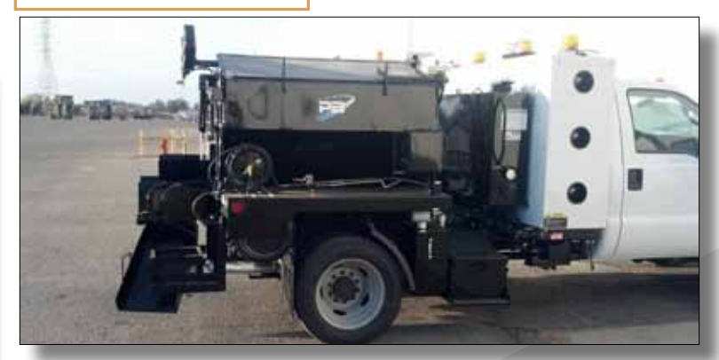
Any Capacity To Meet Your Requirements

Available in 1.5 to 10 cubic yard capacity. Fully insulated with 2" of industrial fiberglass insulation. Custom sizes also available; please contact us for details.