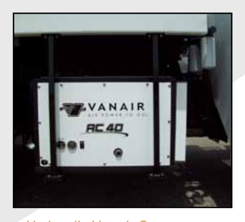
Hydraulic Vanair Compressor