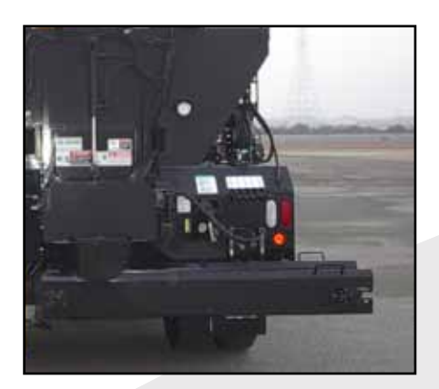
Side Dumping Conveyor