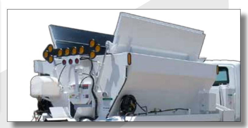
Fully Insulated Top Loading Doors

Available in 1.5 to 10 cubic yard capacity. Fully insulated with 2" of industrial fiberglass insulation. Custom sizes also available; please contact us for details.