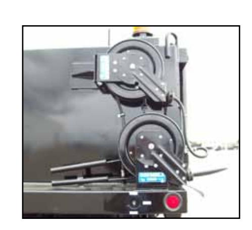
Retractable Hose Reels