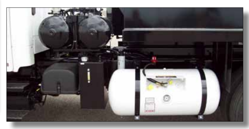
Convenient Heat Sources To Meet Your Needs

The Radiant Heat System on PB Patchers keeps asphalt hot for a full shift. Welded heat tubes spread the heat throughout the asphalt container. Temperature range is adjustable from 100° to 300°.