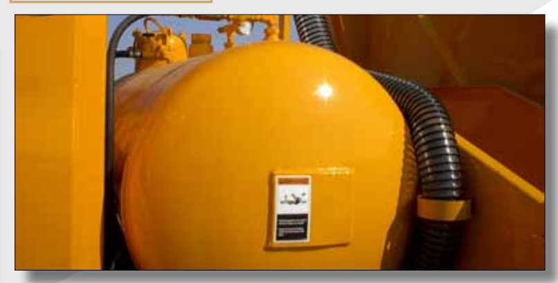
CS Model Emulsion Spray System

Compressed air type sprayer. Sizes available: 35, 60, 130 and 200 gallon. Optional solvent tank and overnight heat system.