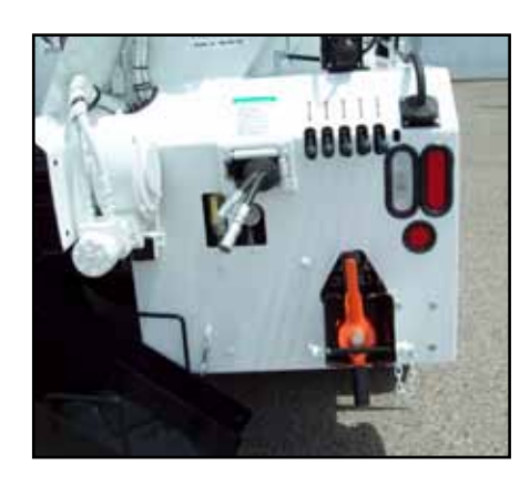
Hydraulic Tool Circuit