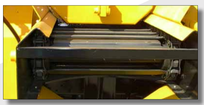
Heavy Duty Steel Chain Conveyor

An extremely durable, long-lasting Kevlar belt moves asphalt out of the container for continuous operation.