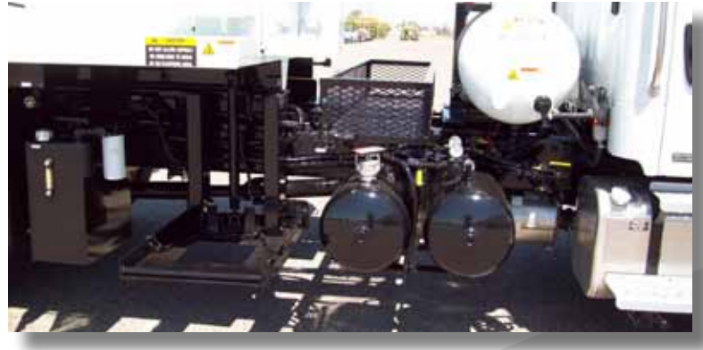
Your Choice of Options and Layout

Your choice of options and layout available for end user efficiency and adaptation to your unique patching program.