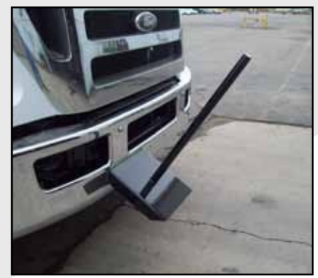
Bumper mounted Cone Holders save space and increase visibility.