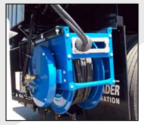
Dual hose reels optional for convenient air and emulsion spraying from the same wand.