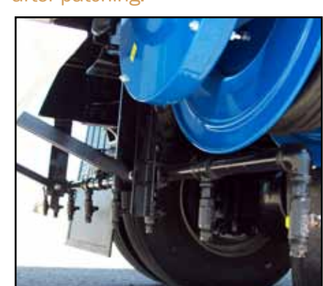
Spray bars allow your pothole patcher to double as a liquid asphalt distributor when necessary.