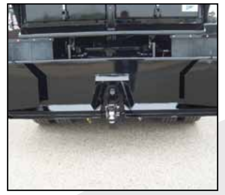
Options available for all hitch types and heights.