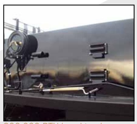
200,000 BTU hand torch eliminates moisture from potholes prior to sealing and patching.