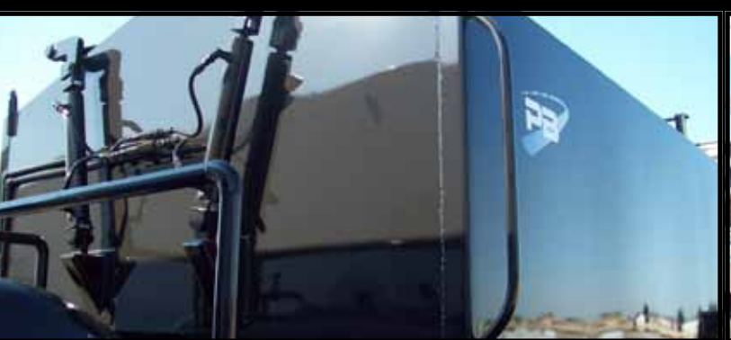
Heavy duty insulated asphalt boxes for durability and heat retention.