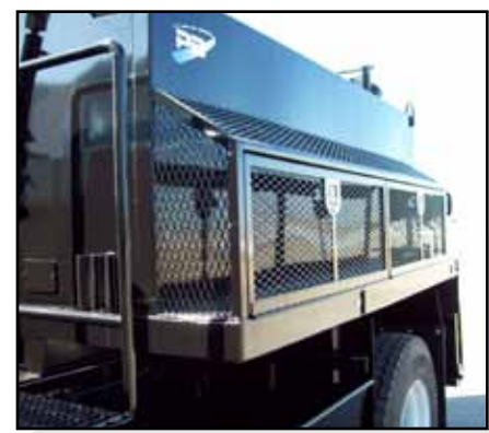
Secured storage in any size and shape for tools of any kind.