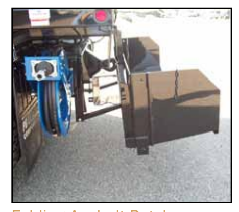
Folding Asphalt Patch Apron is removable for your convenience.