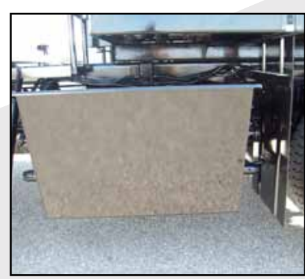
Hydraulic Dumping Spoils Bin