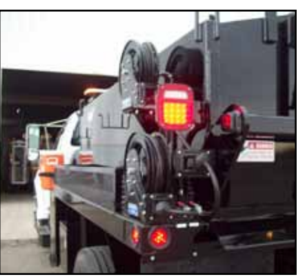
Air and solvent wands aid in clearing debris from potholes prior to sealing and patching.