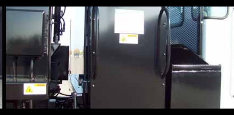
Several compaction options for pothole longevity.