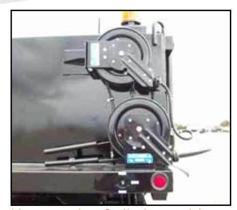
Hose reels of all sizes with the ability to mount in any location.