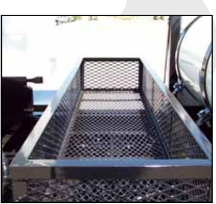
Easily accessible tool baskets for large or bulky items.