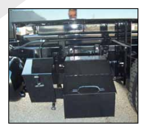
Sand box carries base material for deeper potholes and a solvent dip tank to clean tools before and after patching.