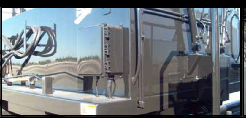
Integrated asphalt heating and emulsion systems to ensure waterproof pothole patching.