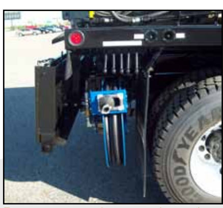
Rear ergonomic controls and pneumatic lines located curb side to keep workers away from traffic hazards.