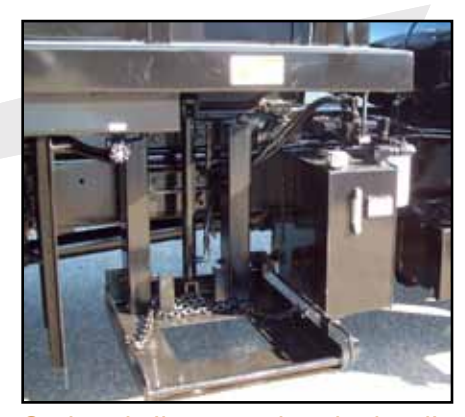
Optional vibratory plate hydraulic platform to reduce back injuries relating to lifting hazards.