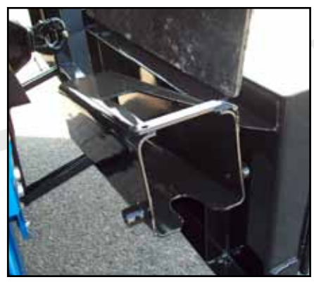
Pneumatic breakers and custom lockable holders built to fit your hammer.