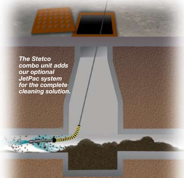
The Stetco combo unit adds our optional JetPac system for the complete cleaning solution.

A watertight debris container with full-perimeter splash guard stores 7 cu yd (5.4 m 3 ) of material on a single-axle chassis. Quick setup and a stowable boom allow you to move from job to job quickly and efficiently.