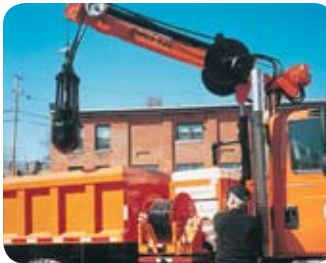
Quiet operation allows you to work in urban environments without bothering bystanders or residents.

In addition to cleaning catch basins, a Stetco unit can act as a dump truck and can be outfitted to double as a snowplow and road sander for work during the winter months. An optional hydraulic tool interface allows you to operate tools like sump pumps, paving breakers, and chainsaws at the job site.