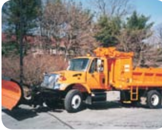
The versatility of a Stetco unit is perfect for smaller municipalities on a tight budget.

From orange peel buckets to rectangular or round clamshell buckets, there is a range of models and sizes to accommodate different catch basin dimensions. All Stetco buckets hydraulically squeeze debris to remove unwanted liquid — which means you haul only the debris, not the liquid.