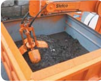
Stetco buckets allow high-volume debris removal in minimum time.

From orange peel buckets to rectangular or round clamshell buckets, there is a range of models and sizes to accommodate different catch basin dimensions. All Stetco buckets hydraulically squeeze debris to remove unwanted liquid — which means you haul only the debris, not the liquid.