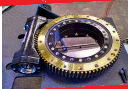
Hydraulic Slewing Bearing