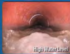
High Water Level