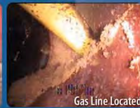
Gas Line Located

800.327.7791 www.cuesinc.com salesinfo@cuesinc.com